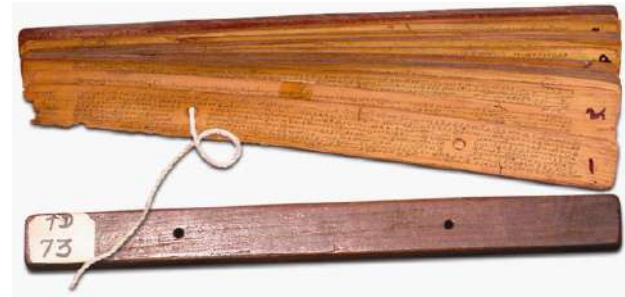
Fig 1.1: Wooden planks slightly bigger than the leaves dimension are placed above and below the manuscripts as a protective cover. A cord is passed through the holes made to binds the leaves.

holes and bound around the manuscripts to keep the leaves in position. The wooden holders were polished with insecticide oils prepared from lacquer and minerals. Illustrations are also seen on the cover boards, the drawings were based on the contents of the book. Finally, the bundle is wrapped in cloth to keep it free from dust” (Agrawal 1984:34).