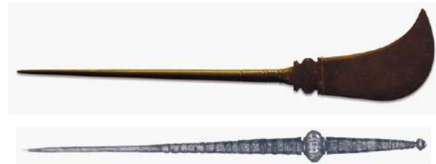
Fig 1.4: Various types of metal stylus were used for writing on palm leaf manuscripts.

a. In one method, the stylus is held in the right hand, at a fixed place on the leaf. The leaf is held in the left hand and is moved backwards and forward to make the incision (Fig 1.5). In this method, both hands are actively involved in the writing process and their coordination is important to scribe letters. In right hand, the stylus is held upright between the ring finger and last finger. The left hand, apart from holding the leaves, also controls and directs the stylus using the thumb nail. Scribes who write on palm leaf usually grow their left thumb nail through which a hole is bored to hold the stylus. Alternately, some people make a groove in the nail to hold the stylus. To write, the stylus is placed over the groove of left thumb nail and incisions are made letter by letter. As the writing progresses the leaf is moved leftwards using the left hand. At times, the holes made on either side to bind the leaves get bigger with frequent use. Therefore, a sufficiently large margin had to be provided around the holes (Fig 1.6).