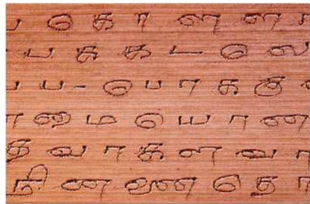
Fig 1.3: Tamil palm leaf manuscript written using incision with pointed metal stylus. On the right is a cross section of the written palm leaf showing incision and deposition of black powder.