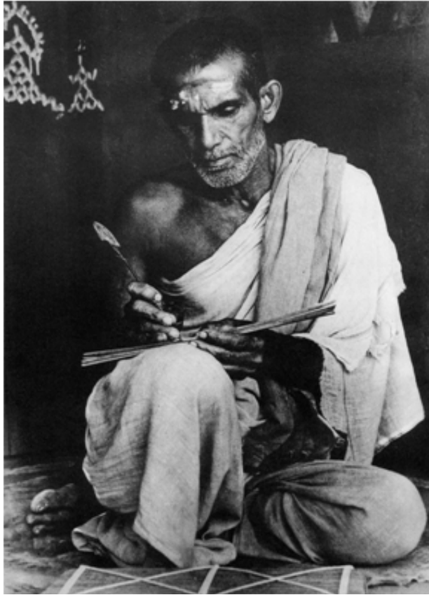
Fig 1.7: Another method of writing on a palm leaves where the leaves are held on the thighs and scribed using stylus. In this method, the stylus is held like a normal pen.

an analogy, its movement could be compared with the type caster of Monotype type machine where the matrix moves in x, y direction to cast individual letters.