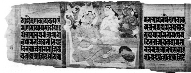
Fig 1.2: Illuminated palm leaf manuscript of 18th century from Eastern India. The text is written using brush and ink.