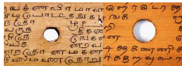
Fig 1.6: Holes punched for binding the leaves are the only elements which breaks the text flow. A sufficient margin is given around it as they expand due to usage.

During the process, the left thumb plays a crucial role in supporting and directing the stylus. It controls the stylus to properly align and position the start of next letter. Perhaps, this determines the letter spacing and some cases even line spacing. The extent at which the left thumb nail moves is one of the factors which determine the size of letters. To draw