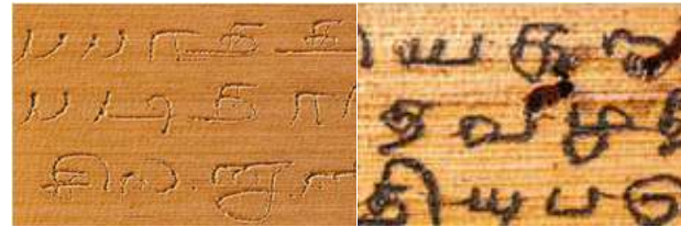
Fig 1.8: Left image shows a manuscript after incision. Initially, the letters may not be noticeable to read. Therefore, to make it visible a paste of charcoal powder mixed oil is smeared on the manuscript and wiped off. The black mixture gets deposited on the grooves making the letters stand out like the right side image.

After incision, the letters may not be visible to read (Fig 1.8). Therefore, lamp-black or coal powder mixed with oil is applied on the leaves so that the letters become noticeable and read more easily. The excess mixture is then wiped off with a cloth. Sometimes, fresh green leaves of a particular tree are rubbed on the palm-leaf so that the green juice of the leaves gets deposited in the engravings rendering it visible. Since correction or overwriting was difficult, great attention was required to make each leaf error free. The palm leaf manuscripts also had illustrations, either incised or painted with a brush. The illustrations are incised with the stylus in the same manner as writing.