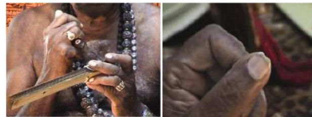
Fig 1.5: Method of writing on a palm leaf manuscript. Right side image shows the groove made in the left thumb nail to control the stylus while writing.